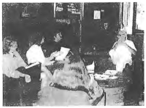
Administrative Transition small group discussion

The need to conduct formal training for administrative classifications recognized early in the Department's training history. The first formal administrative training program was conducted in 1976. In order to keep up with a rapidly changing workplace, that first administrative workshop has been replaced with more specialized training programs such as "Personnel and Attendance" and "Accounting Workshop." Three administrative training programs are scheduled for 1994.