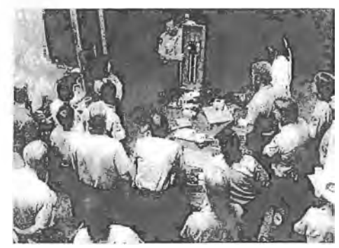
Participants learn electrical wiring in Electrical Skills #20